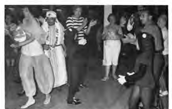
MASQUERADE AT LAKE TARLETON