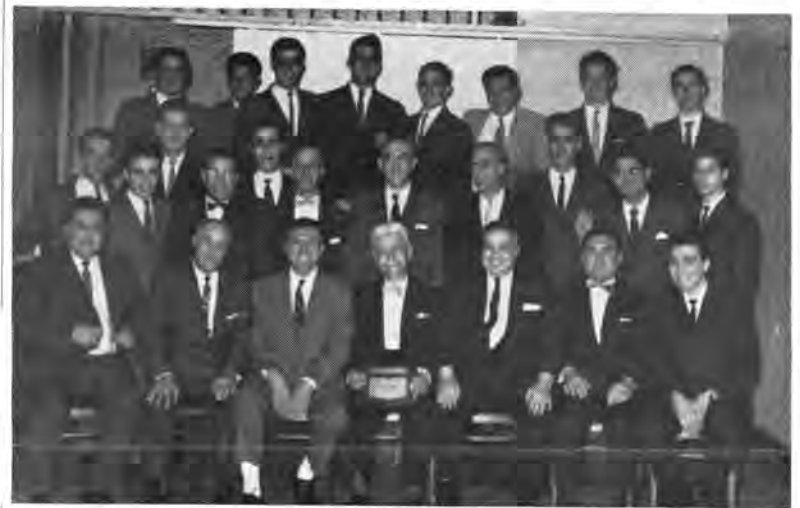
BAC alumni and Delta undergraduates at the Clubs 1st Annual Honorary Dinner